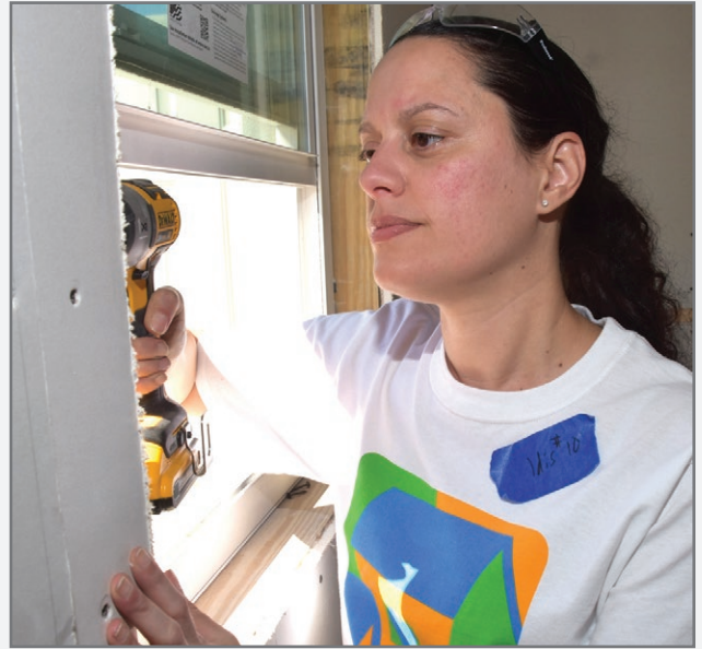
Assurant is a proud supporter of Habitat for Humanity. Here, a member of Assurant's marketing team takes a break from her day job to hang dry wall.

Common sense, common decency, uncommon thinking and uncommon results guide the way we support our customers and work with each other.